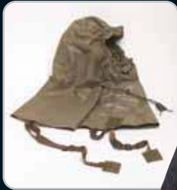
Butyl Coated Nylon Hood