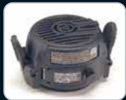
ESPII® Communications system