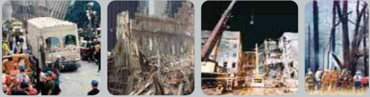
September 11, 2001 changed the face of homeland security

With nearly a century of history and success behind it, MSA today again stands ready to protect Americans – this time against potential airborne contaminants that could be unleashed by terrorists across our homeland.