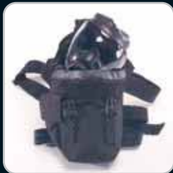
Gas Mask Pouch